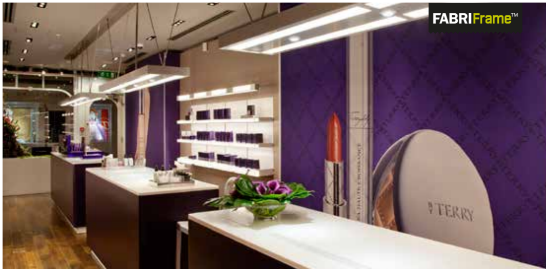
You can change FabriFrame™ graphics as often as you like and you can store the used ones for another occasion, simply fold them up and put them somewhere safe and dry.