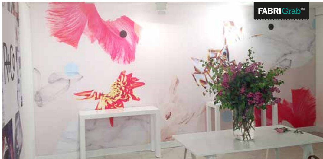
The basement area used FabriGrab™ along the back walls for a vibrant, seamless finish.