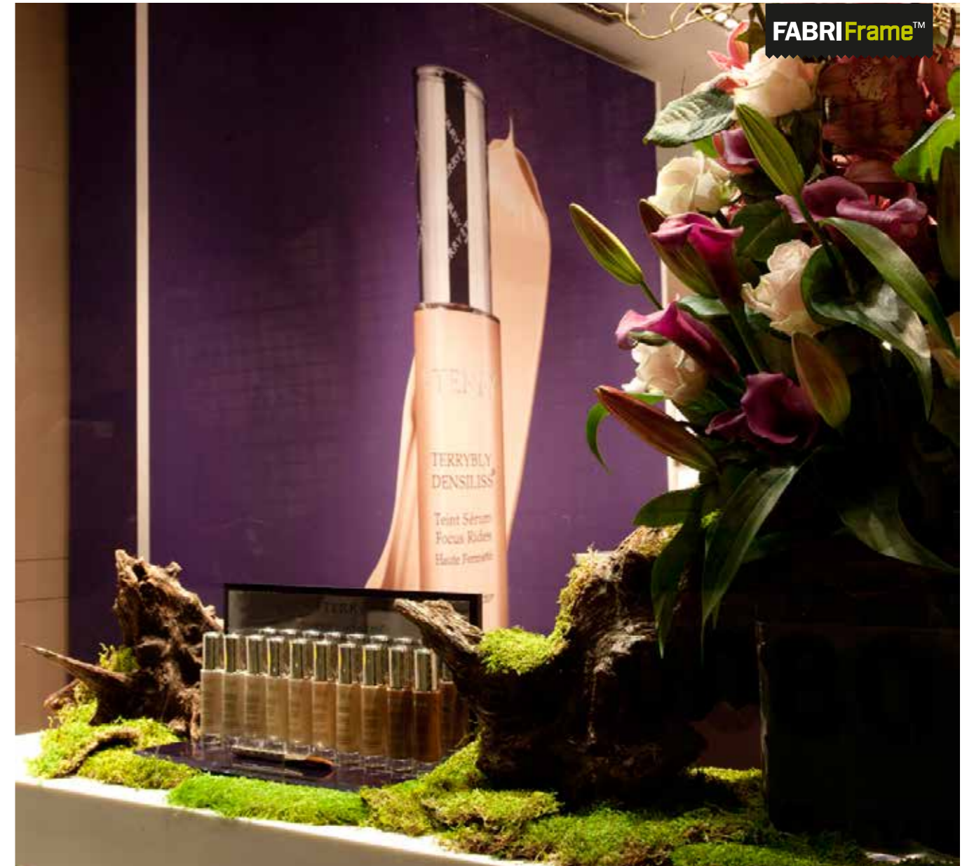
FabriFrame™ units can be wall mounted, ceiling mounted or free-standing. They can even be backlit or used with acoustic padding to reduce echo in large rooms.