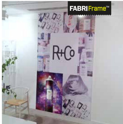
FabriFrame™ units offer a greater flexibility for regular change of fabric images by the Space.NK team. We simply send them a new one in the post.