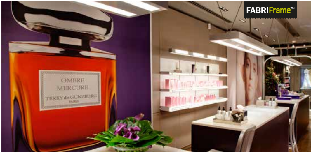
The FabriFrame™ system uses dye sublimation printing which creates rich, vibrant colours.