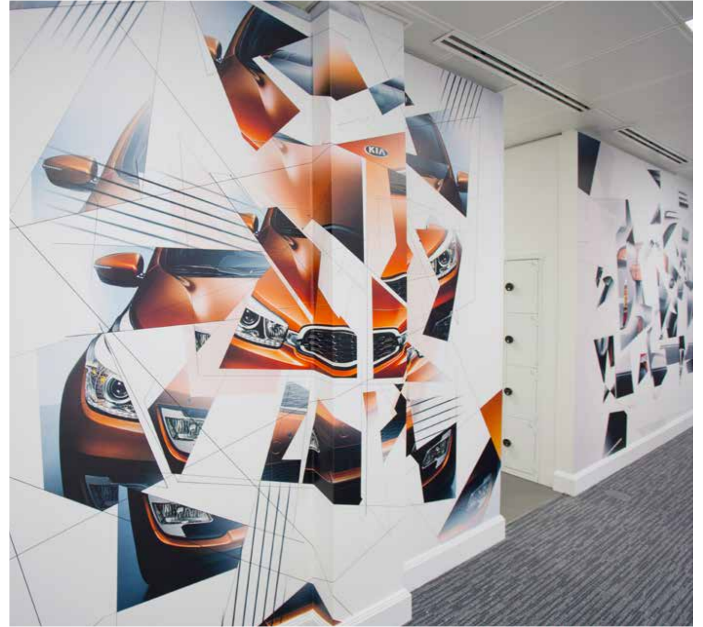
Wallpapers can come in a range of finishes and textures and the results are really durable for high-footfall areas.