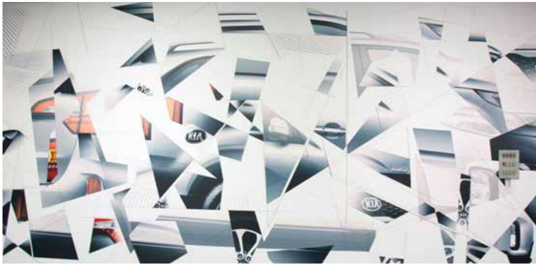
Digitally printed wallpapers are a versatile way to update wall space.