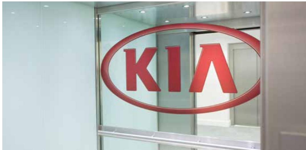
Frosted, printed vinyl applied to the mirror in the lift.