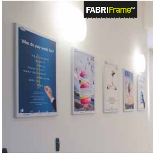
Staff messaging in FabriFrame systems along the corridor.