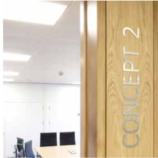
Brushed steel cut lettering applied vertically to the solid wood door frames.