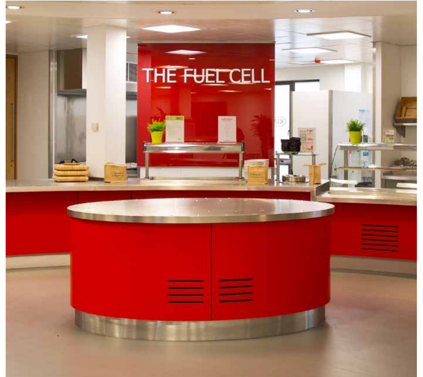
Acrylic letters applied to a high-gloss wall affixed with stand-offs.