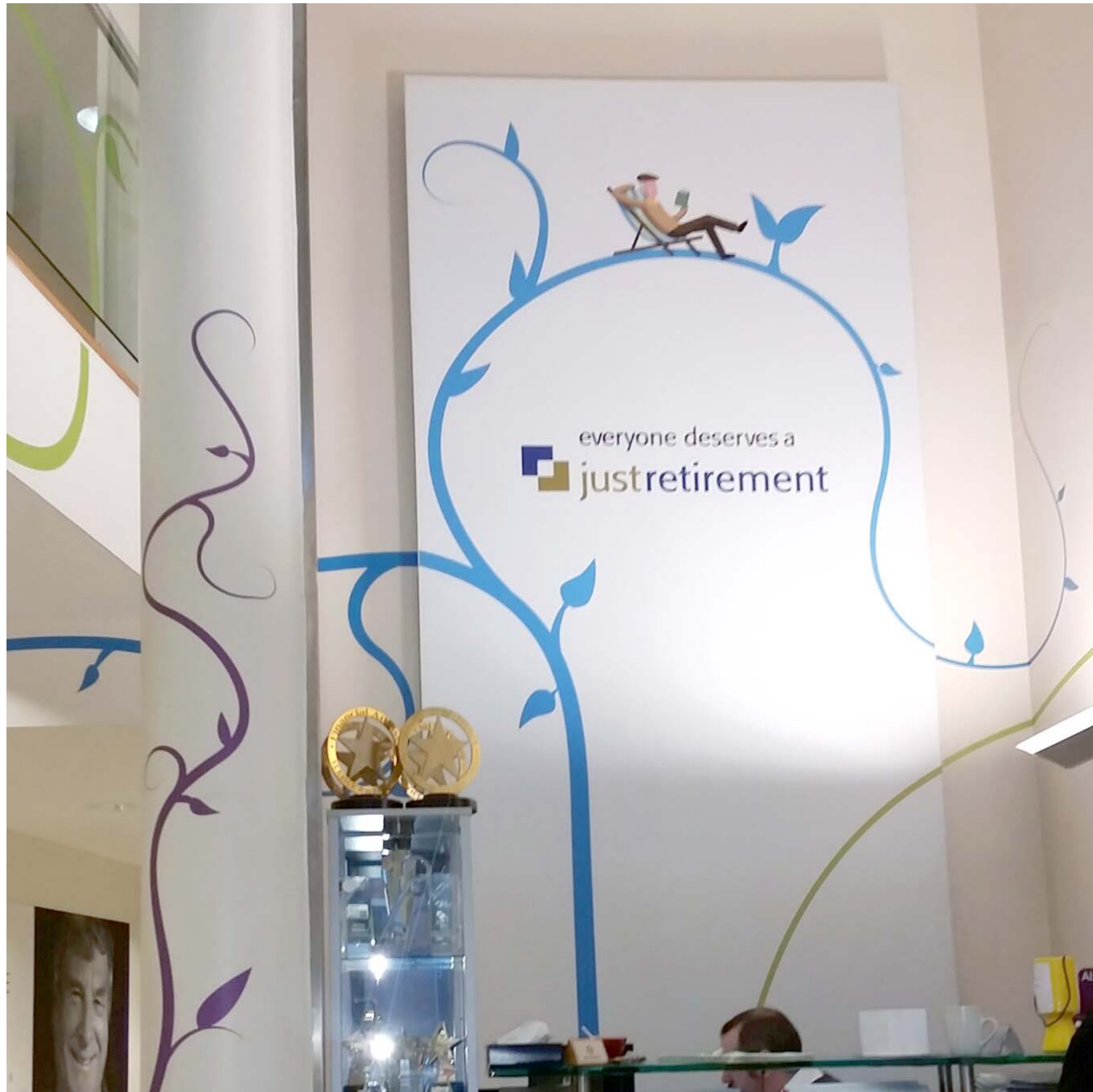
Graphics and signage for BIG ideas