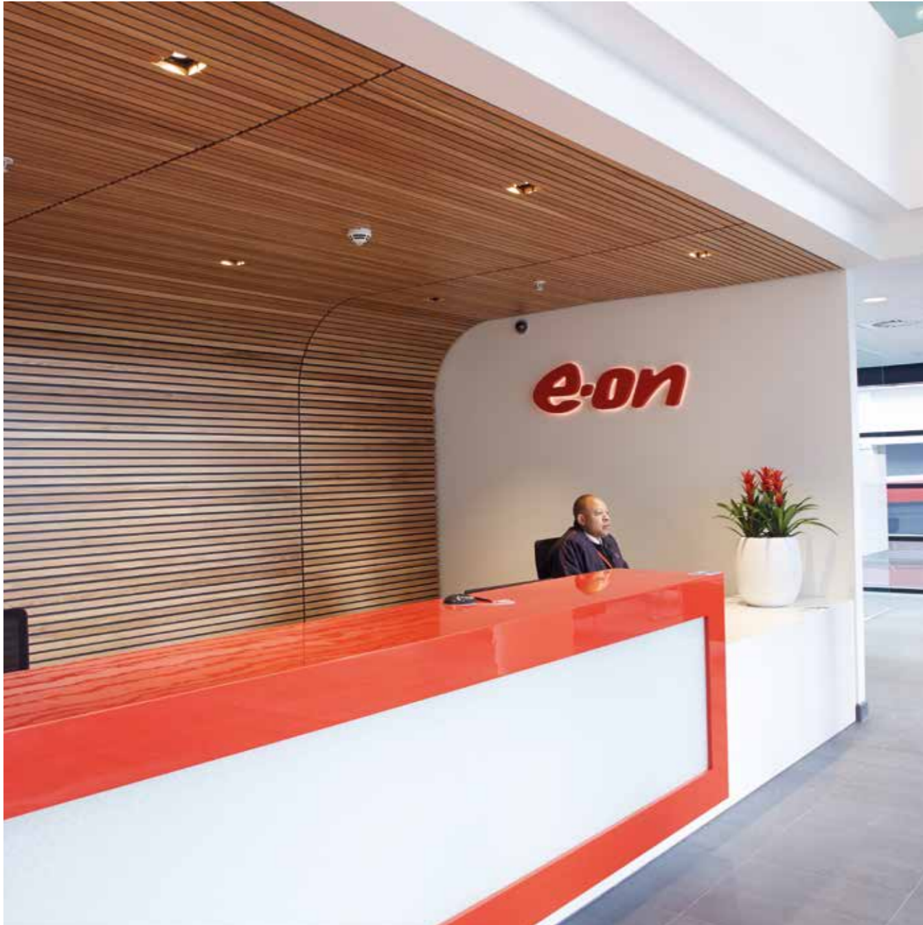
Graphics and signage for BIG ideas