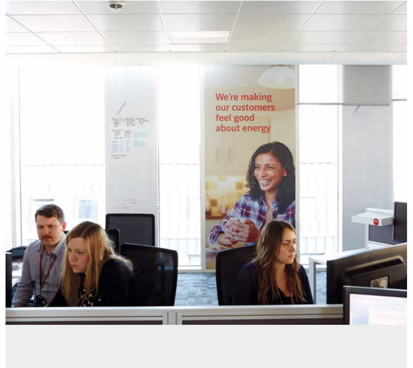
Printed dry-wipe notice boards affixed to walls to provide a bespoke communications display.