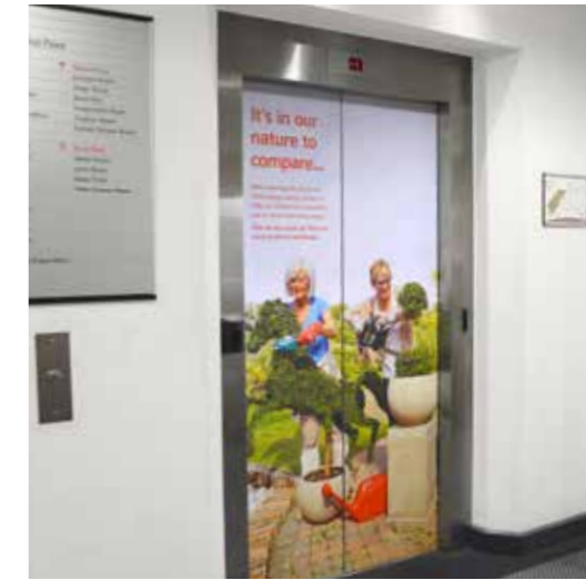
Vinyl covered lift doors