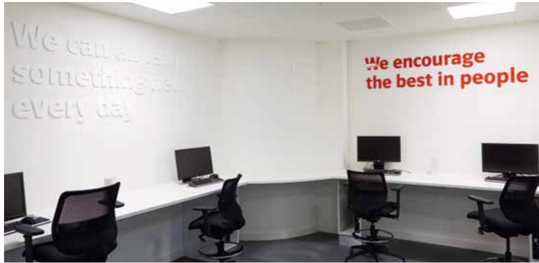
Cut acrylic lettering in a contrasting brand red and a subtle white on white.