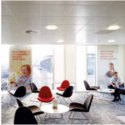
E.ON used a laminated vinyl wall covering to communicate a series of motivational messages in staff areas.