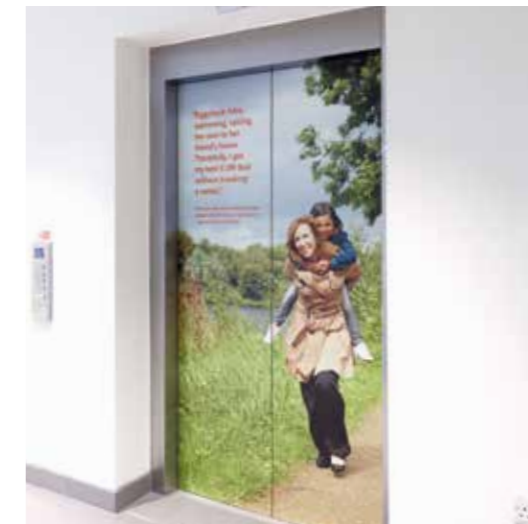
Vinyl covered lift doors