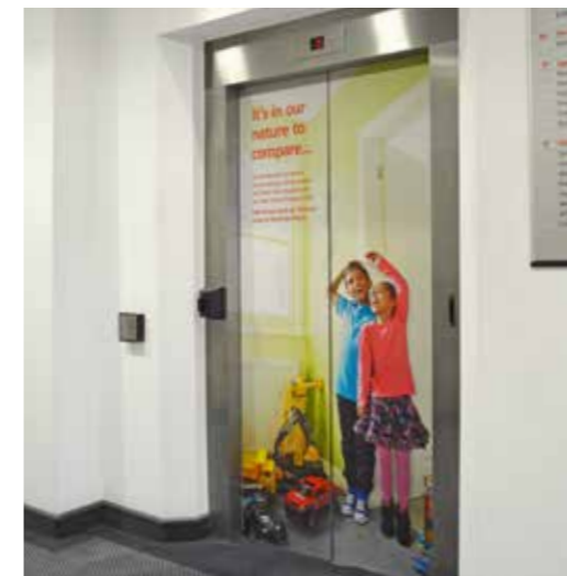
Vinyl covered lift doors