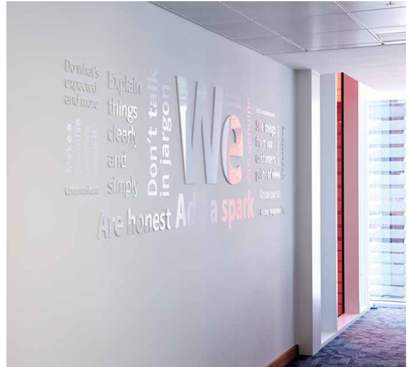
Different thicknesses of acrylic alongside vinyl letting to create a fabulous visual effect.