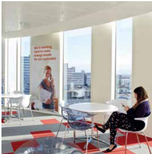
The anti-scuff laminated vinyl is a hardwearing material able to withstand light bumps and knocks.