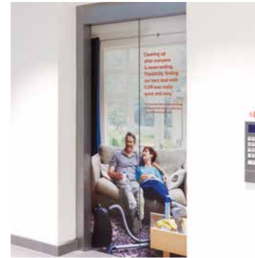
Vinyl covered lift doors