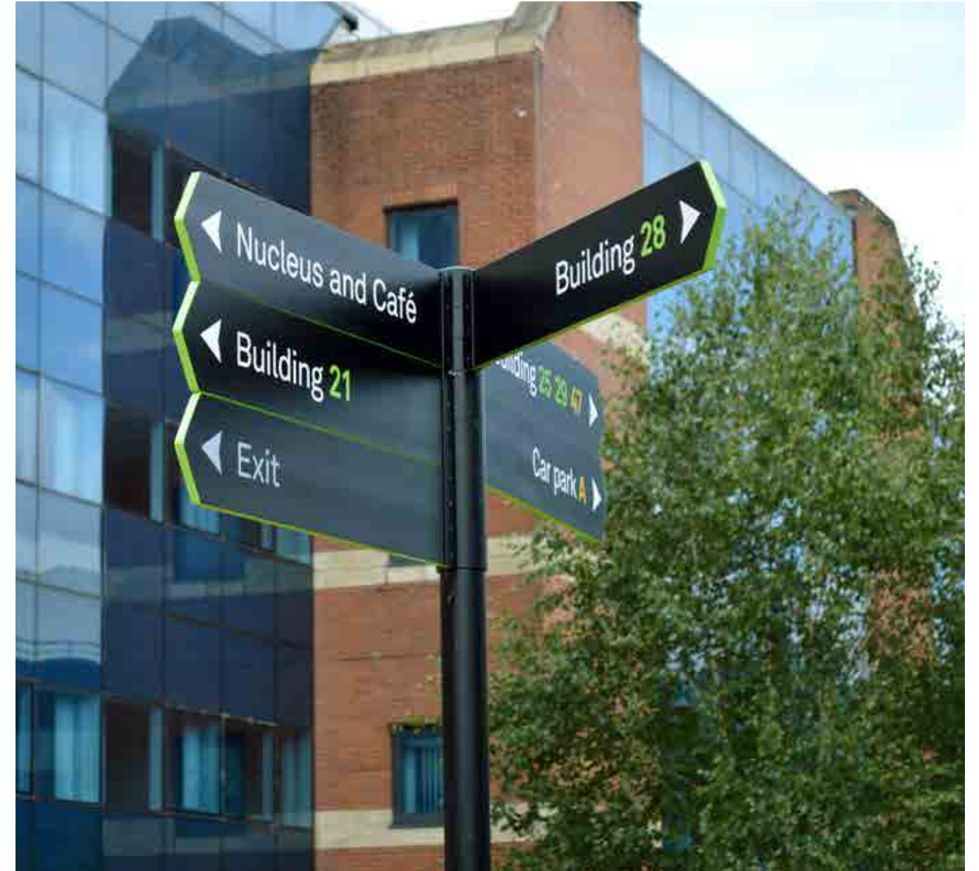
We divided the large site into three sectors which each had their own colour code and the building numbers appear in this colour.