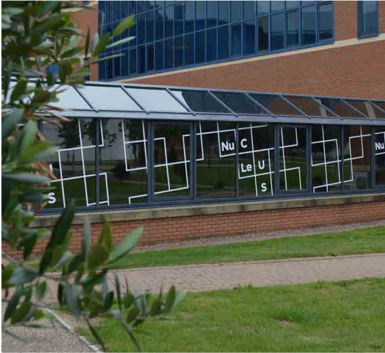
Tinted, solar window film was applied to the inside of the glass corridors to reduce heat and glare. Window manifestations were then applied to the outside of the glass.