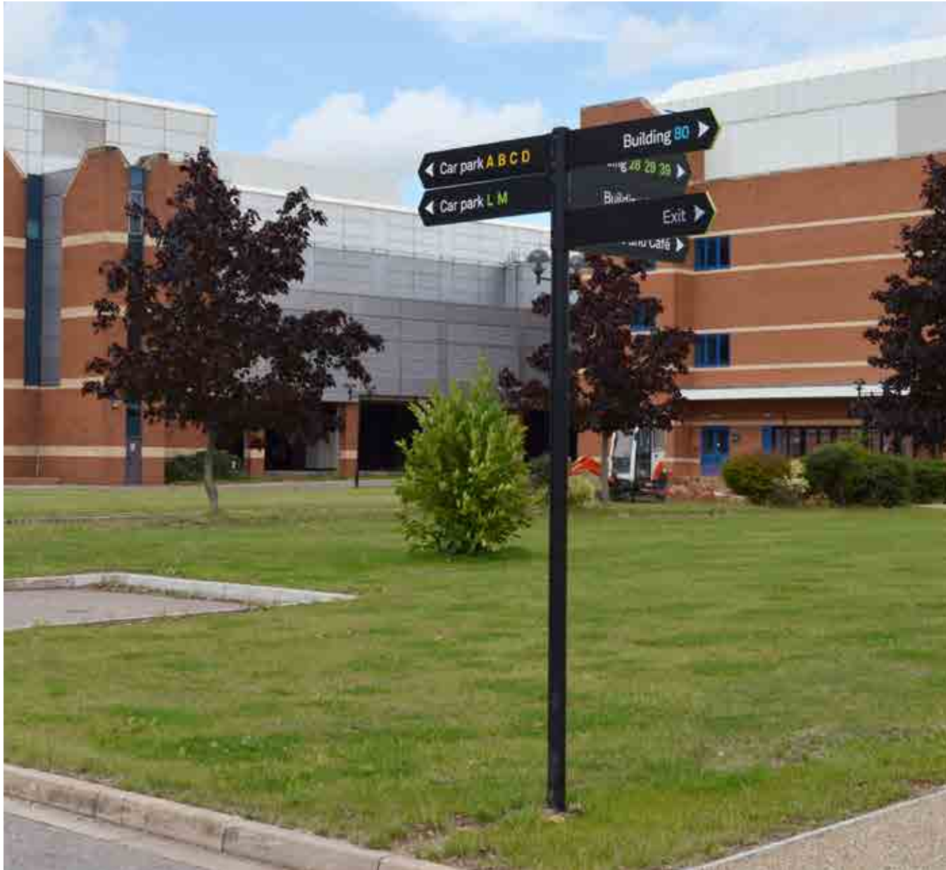
Charnwood Campus' brand palette was mainly black and grey with a flash of bright green. We powder-coated the finger posts matt black, but the fingers were given a bright gloss green colour. We then applied a matt black vinyl to each finger's face which left a vibrant contrasting green band around each edge.