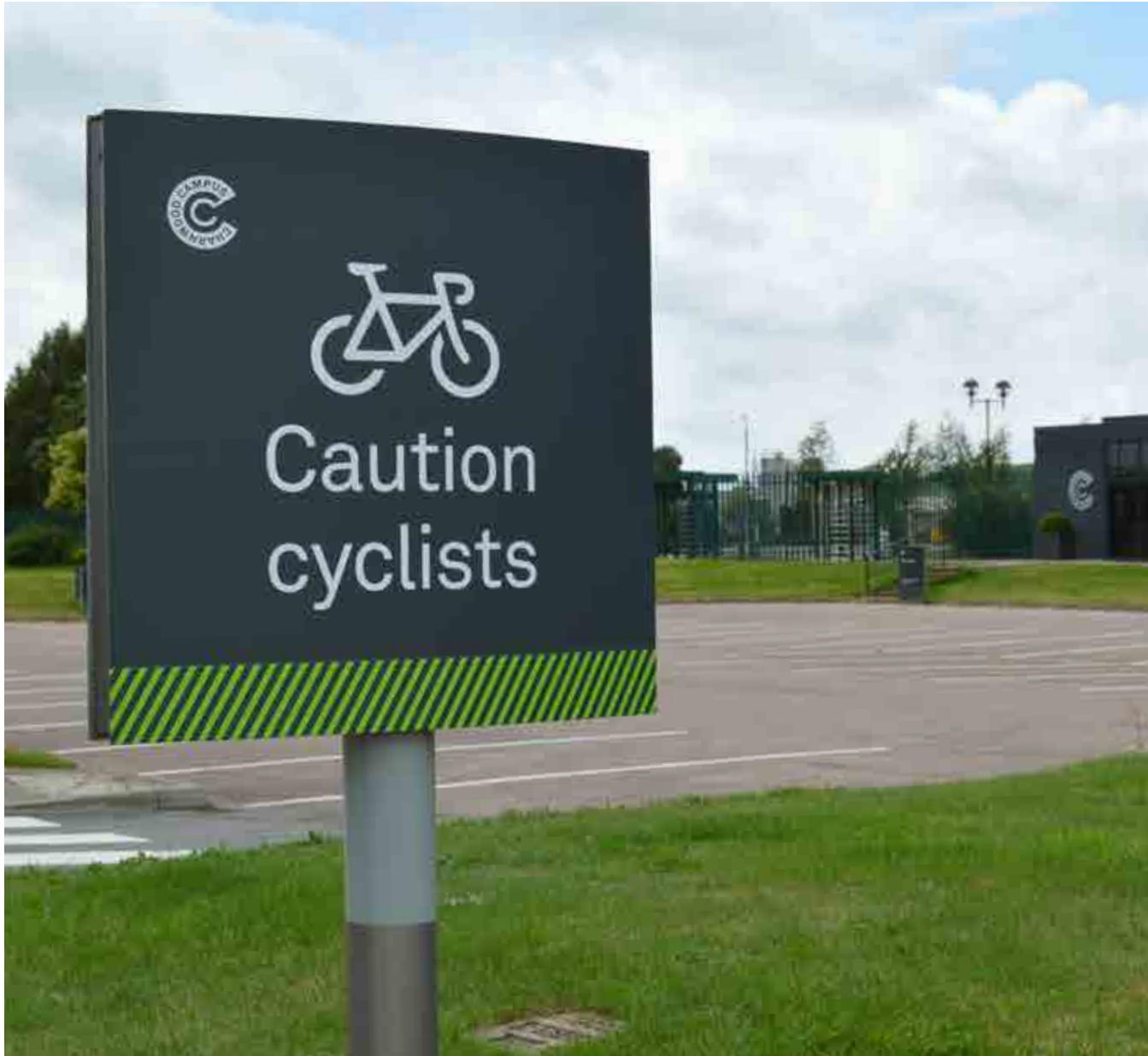
All signage designs followed the same theme, but information signs such as these, were given a slightly different look to directional graphics