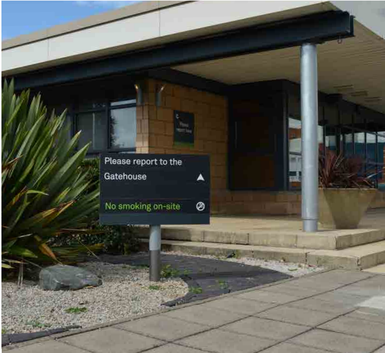
We covered existing modular signage with new vinyl graphics so as to direct visitors to the new building names.