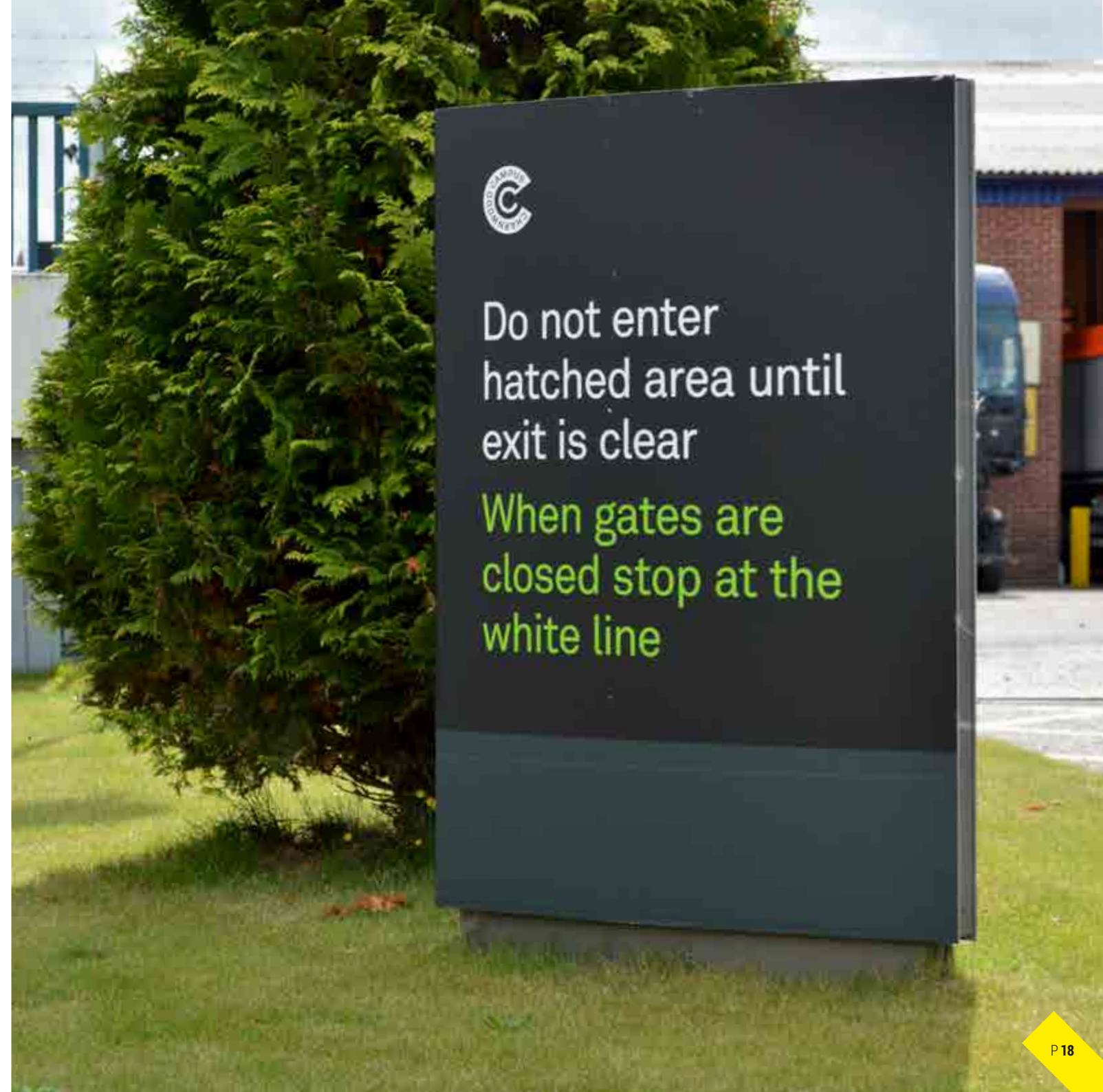
Graphics and signage for BIG ideas