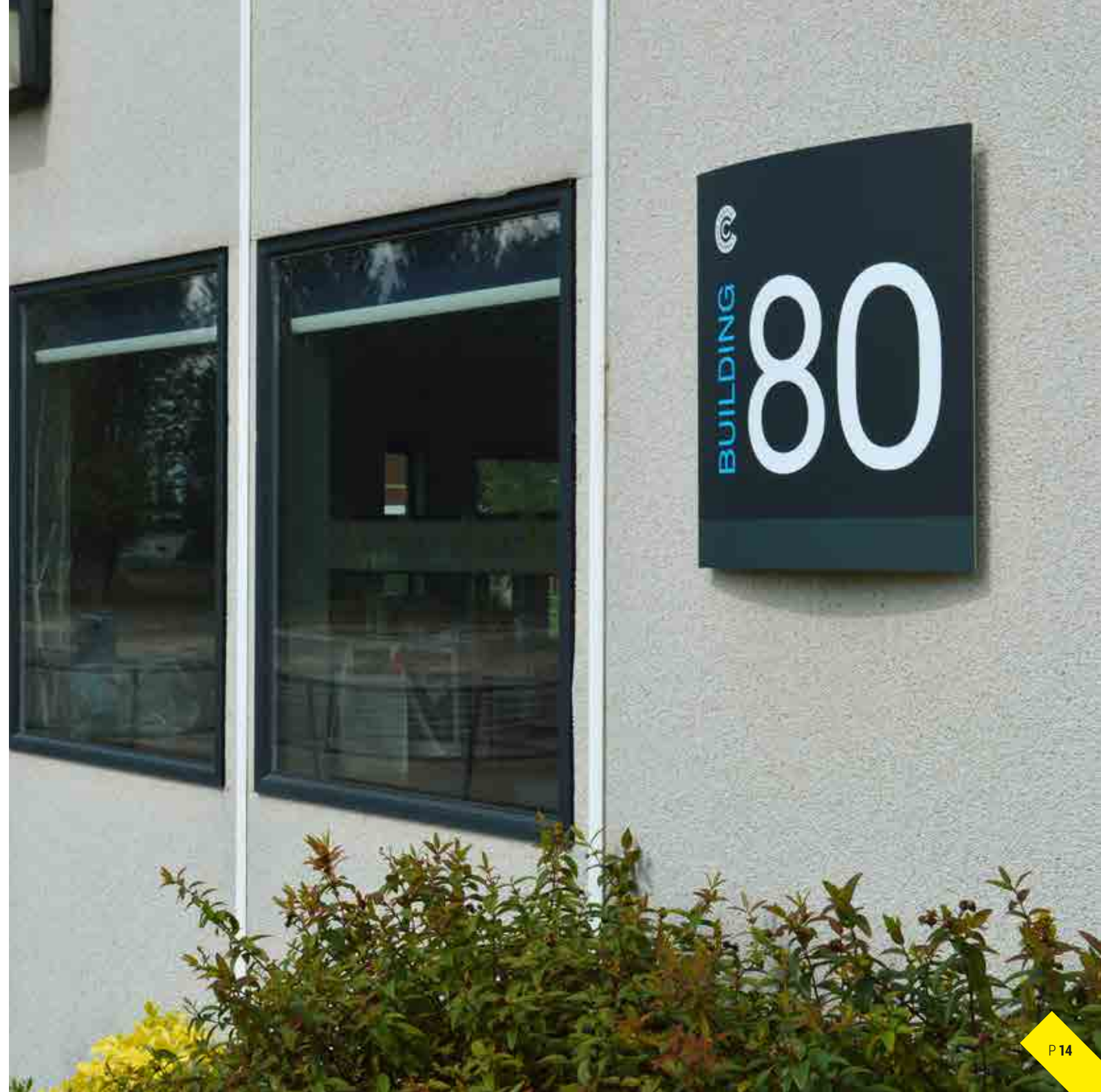
Graphics and signage for BIG ideas