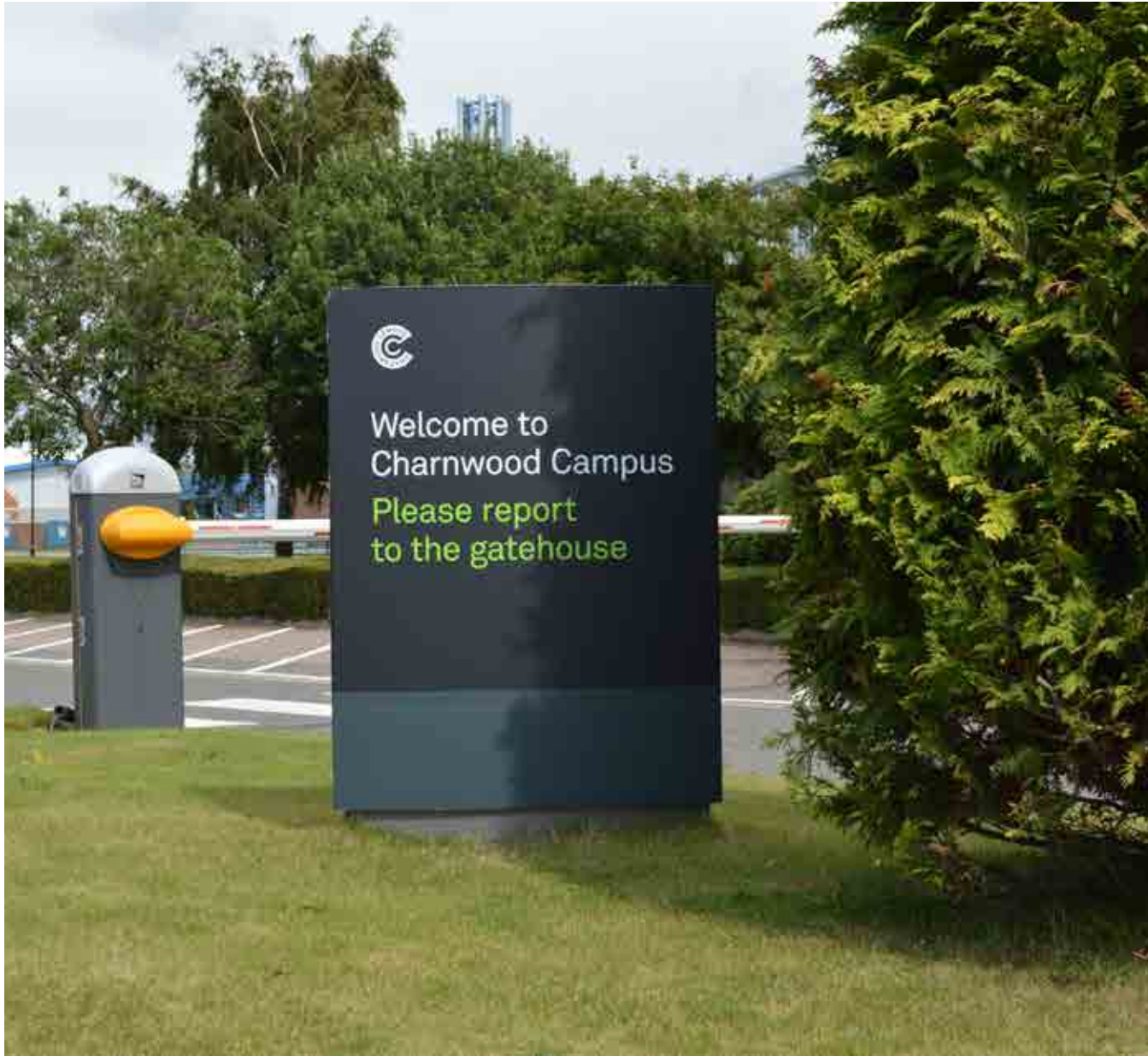
We covered existing totems with vinyl graphics that were on brand. We also used this opportunity to simplify instructions and welcome visitors to the site.